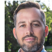
Paul Fleming School of Public Health