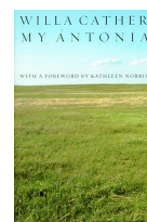
My Antonia by Willa Cather