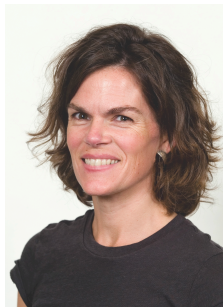
Associate Professor English Language and Literature, LSA

Sponsored by: The Student Sustainability Initiative The Graham Environmental Sustainability Institute The Center for Research on Learning and Teaching