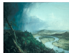
Thomas Cole, The Oxbow