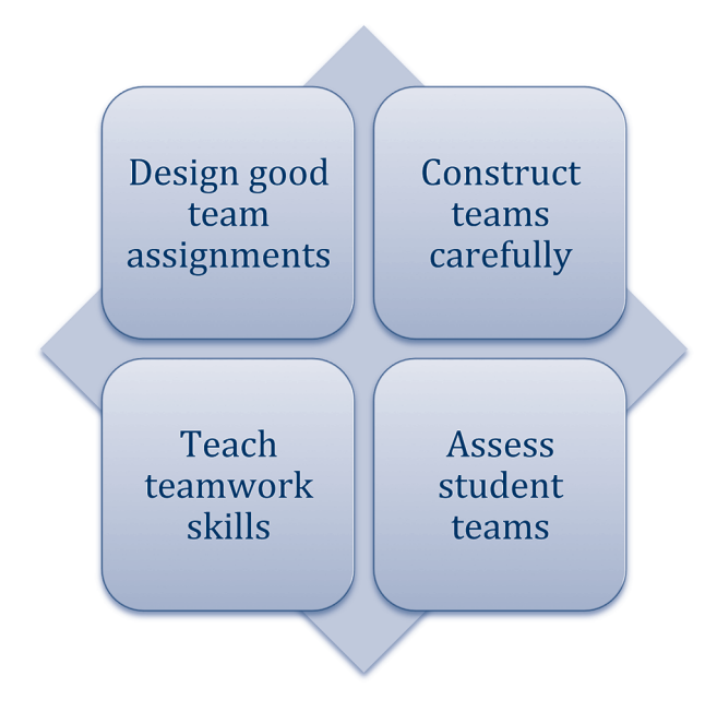
Figure 1. Four components of using student teams successfully

will ensure successful student teams and disregarding one or more of the components may result in an unproductive experience for both students and teachers. We also highlight some of the many U-M faculty who have successfully integrated these components into their teaching. Though the examples come from engineering, the ideas described herein can be applied in a variety of college contexts and can be adopted by instructors with any level of experience.