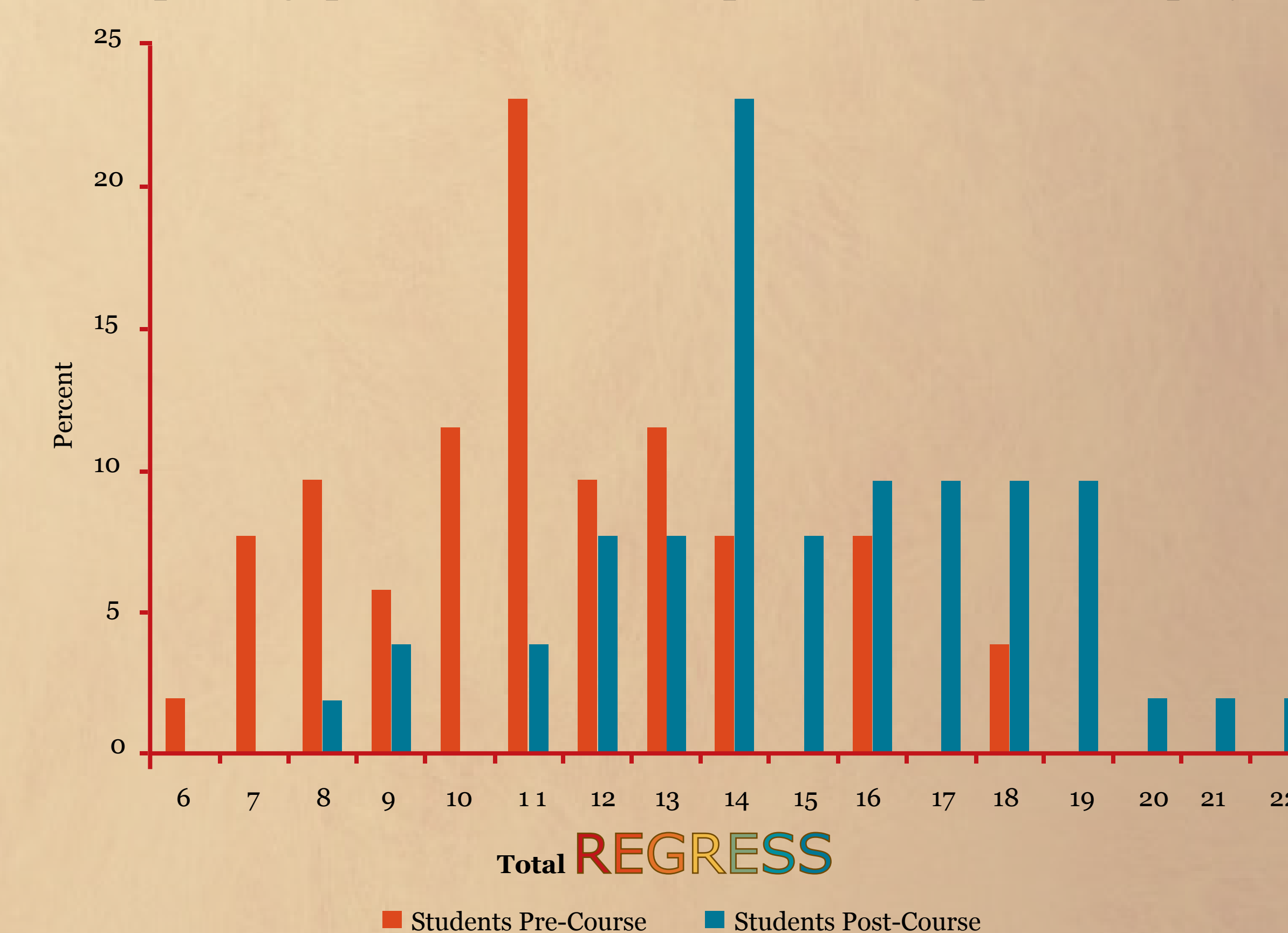
Figure 2: Distribution in pre-course and post-course scores