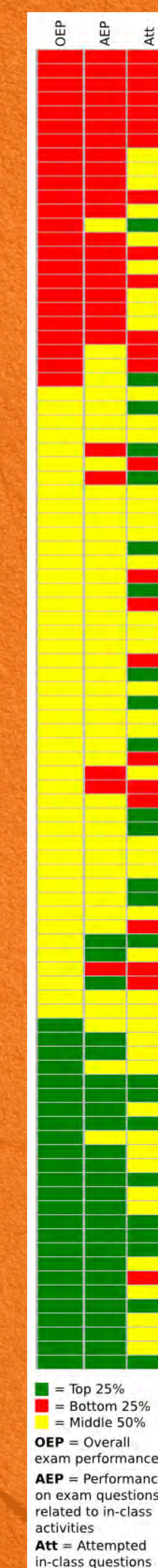
Figure 2: Exam performance and attempted in-class questions (each student is represented as a single row.)

Holding all other variables constant, on average, women scored about 14 exam points lower than men. However, female students completed significantly more image-based activities than men (57 vs. 49, two-tailed t-test, p < .05 ), making their exam scores equal to those of the less participatory men.